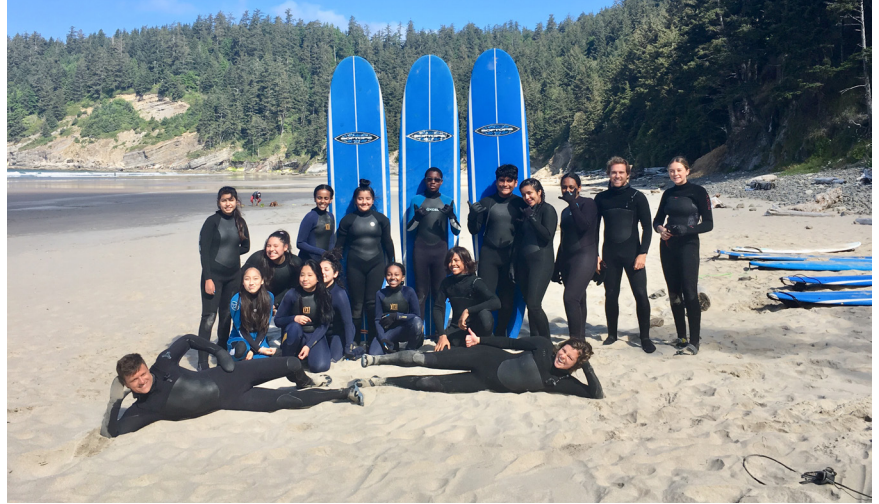
Nativity students get a surfing lesson at Short Sands Beach in Oswald West State Park.